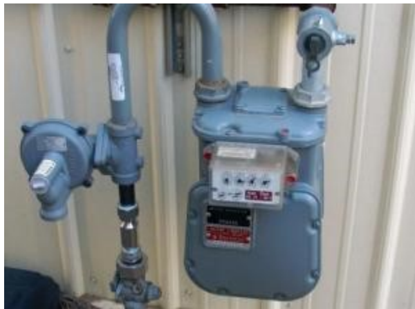
Researchers at the Gas Technology Institute developed a

Excavation damage and other outside force damage are the two single largest contributors to natural gas distribution pipeline incidents. Meter Set Assemblies (MSAs) and other above-ground gas facilities are often damaged by various outside forces, particularly from vehicular damage and falling ice from building roofs. When damaged, MSAs can cause gas leaks, fire, explosion, property damage and personal injury.