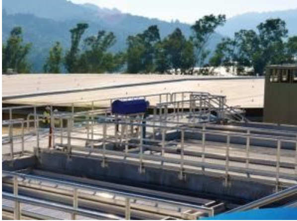
The San Jose Water Company revitalized its largest surface

reliable service, including fewer brownouts and blackouts, and more predictable energy rates for ratepayers - that is, peak demand charges won't be a surprise on future electricity bills.