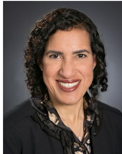
Honorable Liane Randolph Commissioner, California Public Utilities Commission