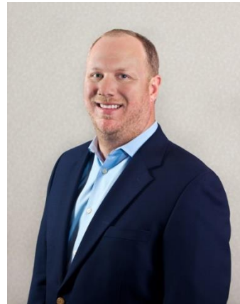
CWA 2 nd Vice President and Program Chair; Director, Regulatory Policy & Case Management, California American Water