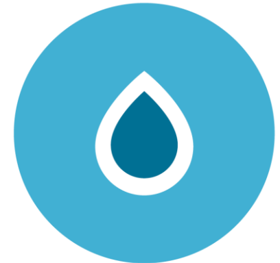
IMPROVED WATER QUALITY