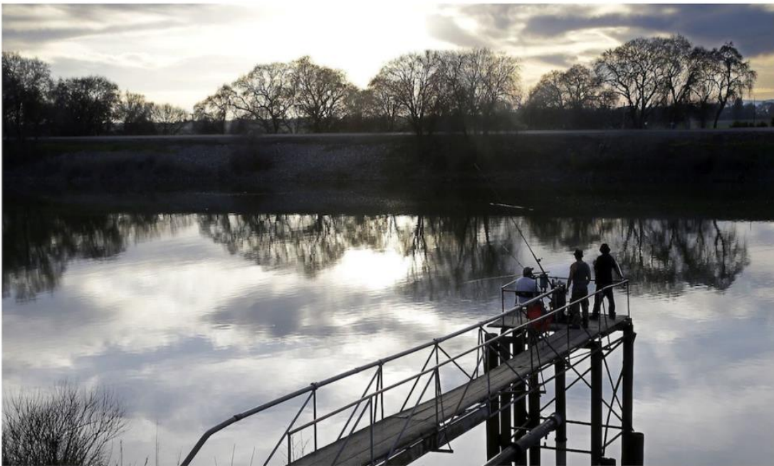
The Sacramento River in the San Joaquin-Sacramento River Delta, near Courtland, Calif. on Feb. 23, 2016.