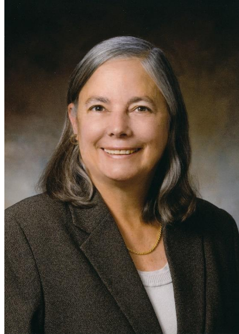
Honorable Fran Pavley D-Agoura Hills Chair, Senate Natural Resources & Water Committee