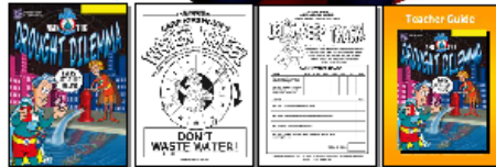
Student Workbooks and Teacher Guide

The National Theatre for Children uses professional actors who perform an action-packed adventure combined with high energy comedy to teach students educational messages through a fun experience.