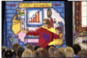
Scene from: The Aqua League and the Drought Dilemma