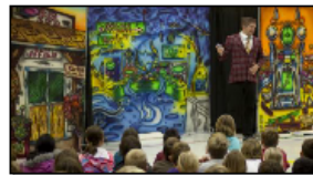
Scene from: The Aqua League and the Drought Dilemma

Performances are performed live in school for K thru 6 th grade students. Each show includes grade appropriate workbooks for each student, comprehensive teacher guides and classroom posters.